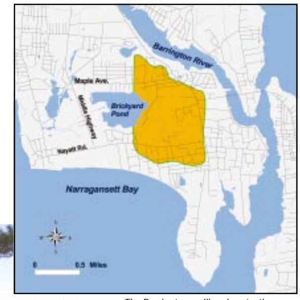
The Barrington wellhead protection area

A review of sampling data shows that all drinking water standards are being met and water is free of contaminants. However, high sodium levels in one well suggest salt water intrusion may occur with overpumping.