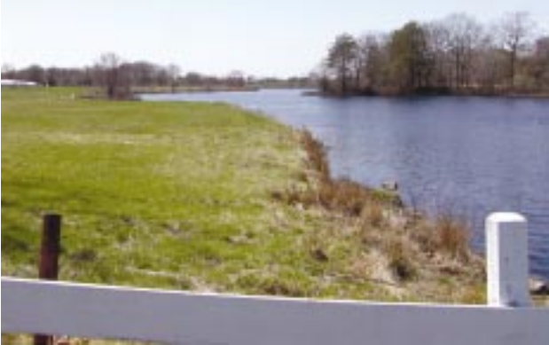
The streamside zone is a critical water quality protective zone. Although forest cover is ideal, natural grass buffers can be good filters when unfertilized and undisturbed. Runoff and agriculture activate.