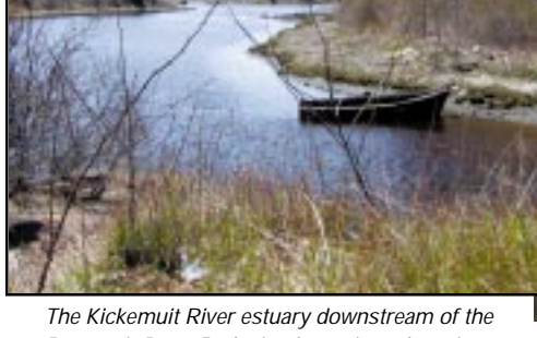
The Kickemuit River estuary downstream of the Reservoir Dam. Reducing bacteria and nutrients in the watershed will help protect downstream shellfishing habitat.